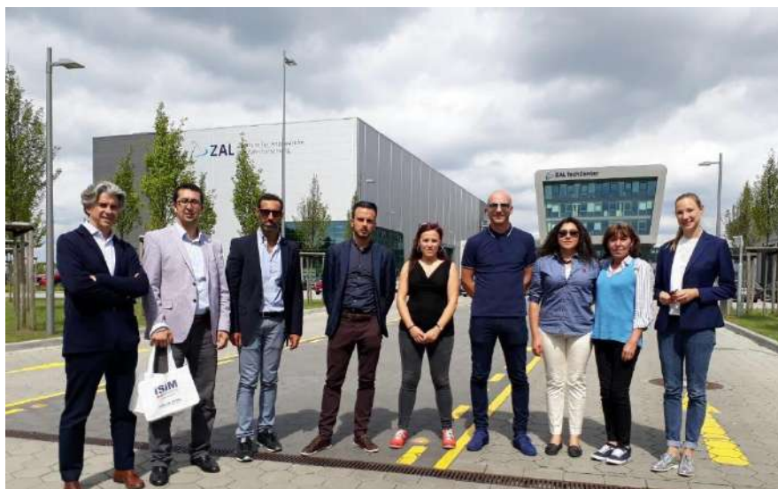
The Clustem delegation in front of ZAL building

With many research and development projects for product and process innovations, the cluster is expanding its core competencies. Projects range from research on fuel cells as a source of on-board energy to acoustic and climatic improvements in the cabin, from adapting maintenance methods for new materials to optimising airport processes. All of these innovations flow into a single vision: the strategy called "a new kind of aviation".